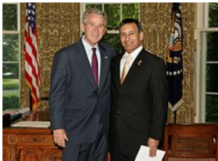
Mr. Haqqani with President G. W. Bush

Another piece in the puzzle is Pakistan's former ambassador to United States of America Mr. Husain Haqqani, who has been accused of treason in Pakistan in a major scandal dubbed Memogate scandal . Mr. Husain Haqqani also recently admitted in his own article published in Washington Post that while he was ambassador, visas were issued to CIA agents apparently to locate and kill or capture Osama Bin Laden. These days Mr. Haqqani is enjoying a nice quiet life in United States after nicely having played the role for which he was chosen as ambassador to U.S. by his boss who took over a political party after the mysterious assassination of his wife which he never investigated during his five-year rule. Makes one wonder that it all sounds too good to be a coincidence.