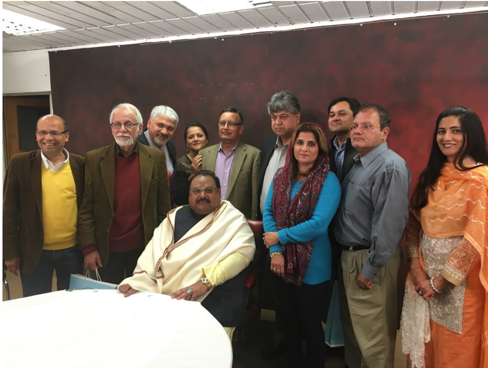
A photo from the London meeting

Below are some more photos from the conference featuring usual suspects: